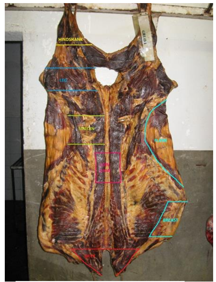
Figure 3. Sampling of Herzegovinian dry smoked goat meat

Chemical analysis. Moisture content was determined by BAS ISO 1442:2007, protein content by BAS ISO 937:2007, fat content by BAS ISO 1443:2007, ash content by ISO 936:2007, pH was measured using pH meter (FiveGo<sup>TM</sup> F2, Mettler Toledo, Switzerland), and a_w value of the samples was measured using an a_w meter (LabSwift -a_w , Novasina, Switzerland). Determination of NaCl was performed by Mohr titration using 0.1 M AgNO<sub>3</sub> and 5% potassium chromate as an indicator (E. K. 8045, JUS., 1993).