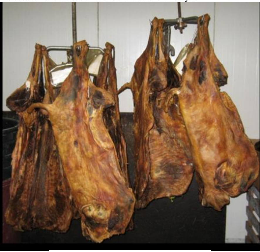
Figure 2. Herzegovinian dry smoked goat meat

For the research, five "steljas" were used (Fig. 2). Eight samples (neck, sirloin, leg, loin, flank, breast, shoulder, hindshank) from different anatomical parts were taken from each "stelja" (Fig. 3). The shoulder pattern in Fig. 3 is not visible because it is located on the lateral side of the "stelja".